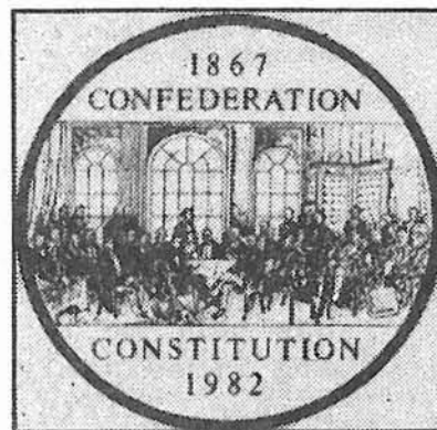
Reverse of commemorative coin shows Fathers of Confederation. It will go into circulation by July 1.