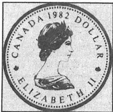
New Canadian $1 coin, commemorating patriation of the constitution, shows the Queen on the obverse.